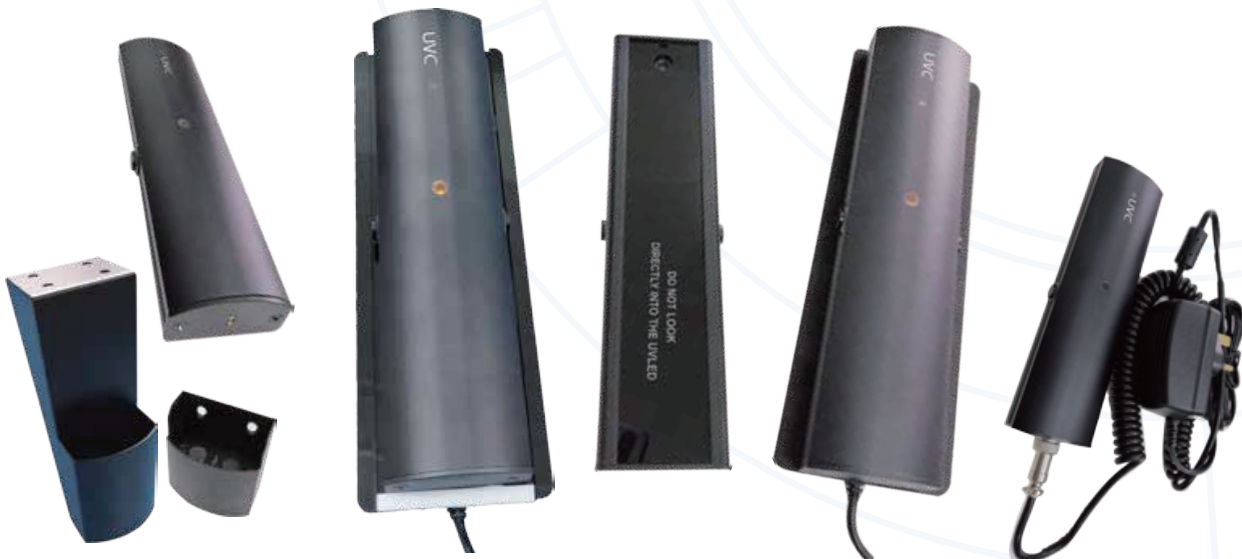
UVC scanner has different model like UVC scanner with cord, cordless UVC scanner, wireless UVC scanner, laser track wireless UVC scanner.