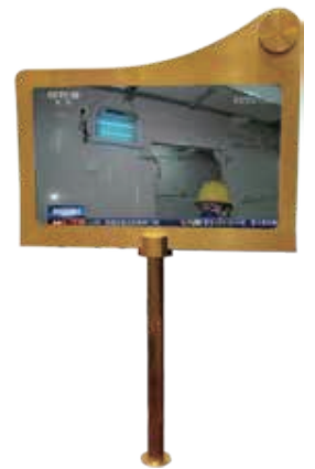
UVC lamp are being widely using in Wuhan hospital, over 3,900 UVC lamps had been installed lately.

(As the coronavirus outbreak as pandemic, our company is willing to stand with the gaming industry, we'll charge no additional cost with the UVC device with our existing scanner model.)